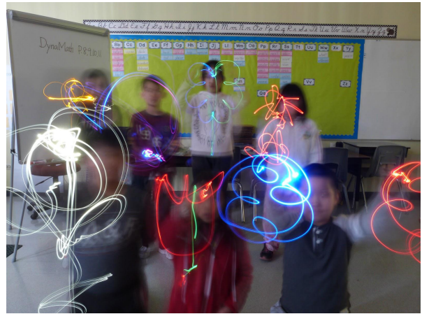
(Right) Fourth Grade Students "Drawing" Flowers using Long Exposure Photography