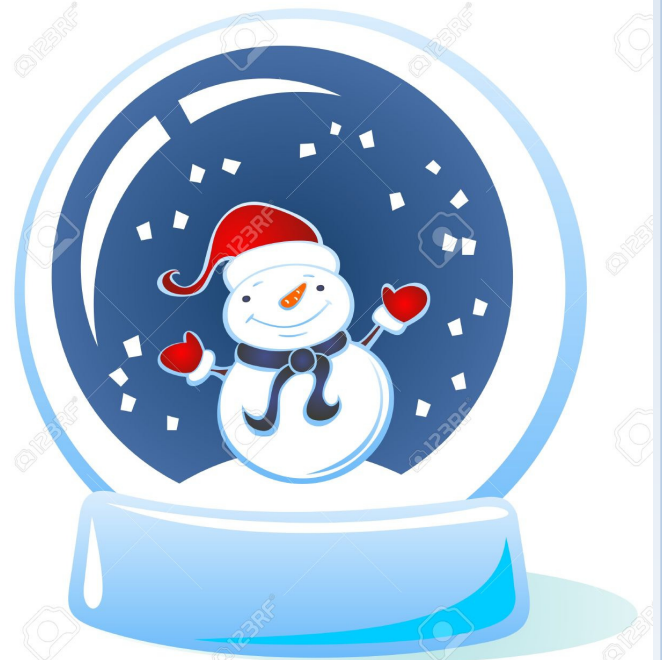
[Happy Winter Break]

How to Help: Talk with Teachers to Resolve Problems Tell the Teacher about Your Concerns; Work with the teacher and tell them your concerns at: https://www2.ed.gov/parents/academic/help/homework/homework.pdf