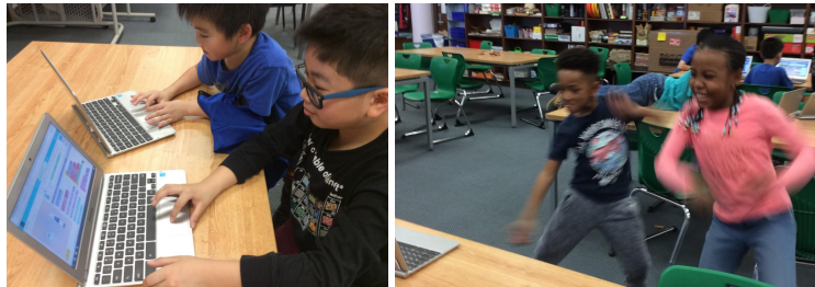
Above: Hour of Code--Students are Coding (and Moving in) a Dance Party