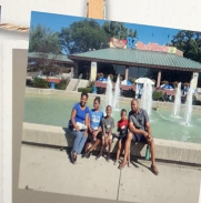
Trip to Brookfield Zoo in 2019