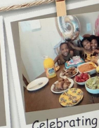
Celebrating sister's 6th B-Day