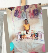
My Cousin's 10th B-Day