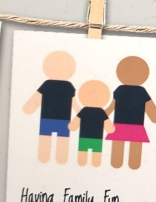
Having Family Fun