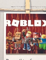
Playing Video Games