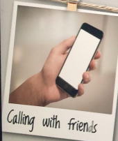
Calling with friends